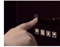
MR-EX655W 745W x 735D x 1821H mm