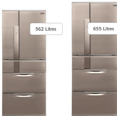
MR-EX562W* 685W x 735D x 1691H mm