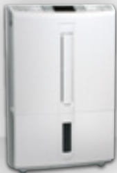
Oasis Classic 22L