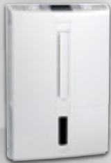
Oasis Classic 16L

The Oasis Dehumidifier Range are advanced home dryers that help your home to “breathe” properly by effectively controlling moisture, dampness and mildew, so you can enjoy a healthier, drier home for your family.