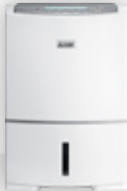
Oasis Pure 38L