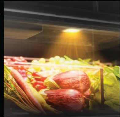
Vitalight LED System