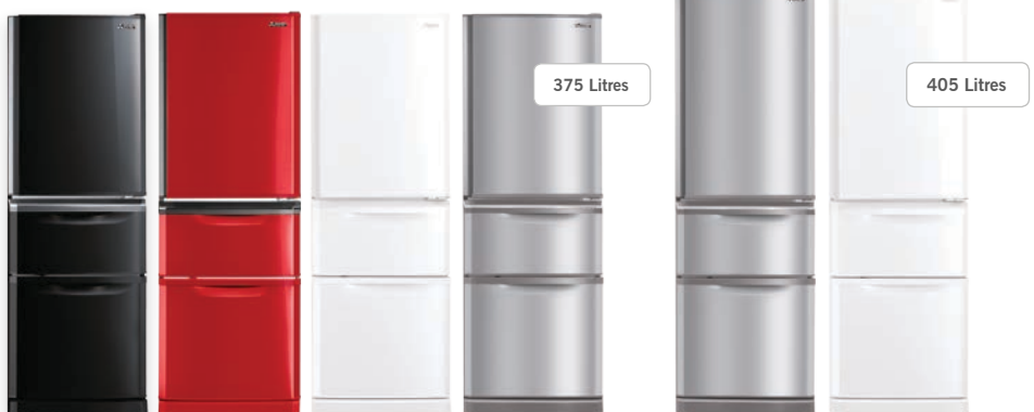
MR-C375G 600W x 666D x 1678H mm

Available in Onyx Black, Red, White or Stainless Steel*.