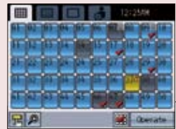
GRID (zoom-out) screen Displays the operation status of all groups.

5-inch color LCD touch panel enables easy and simple operation. The backlight lights up when the panel is touched, and lights off after certain period of time. The touch panel displays the operation status of the units in GRID, LIST or in GROUP.