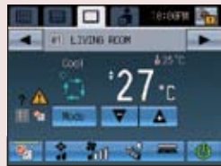
GROUP screen Displays the detailed operation status of each group. Sets group operations.