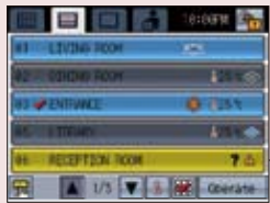
LIST screen Displays the detailed operation status of each group with group name.