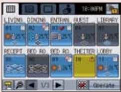
GRID (zoom-in) screen Displays the detailed operation status of each group.