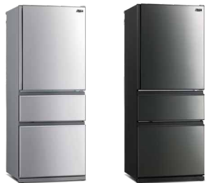
Stainless Steel Black Stainless