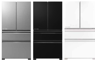
Glass Silver Glass Black Glass White

The LX Series features stunning glass flat panel doors, presenting a striking finish in either silver or black. The toughened glass panels not only look great, they are also durable, easy to clean and dent resistant! Designed to be the perfect family fridge, the glass panels can also act as a whiteboard. Whether it's your grocery list or simply a canvas for the kids' art, use a whiteboard marker to make your own statement.